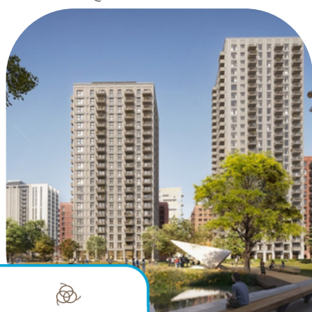
Wembley Park London UK