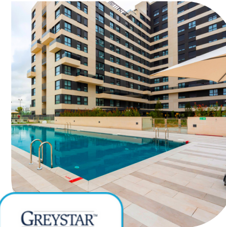
Greater Madrid, Spain