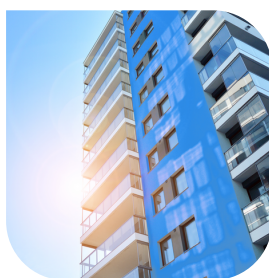
Build to Rent