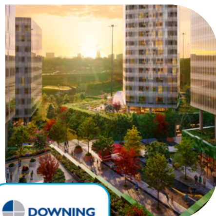
First Street Manchester UK