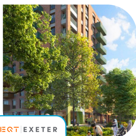
Greater London UK