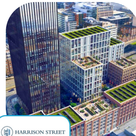
Great Charles Street Birmingham UK